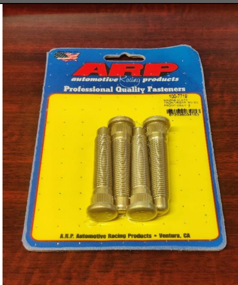
ARP Wheel Stud – 100-7719

This TSB describes: The purpose of this TSB is to allow competitors the option of using ARP wheel studs (100-7719) as an alternative to the MSI wheel studs (0000-04-5905). Flis Performance recommends that you check the manufacture date of your wheel studs and replace them at least annually or when needed.