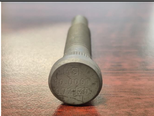
MSI Wheel Stud 0000-04-5905